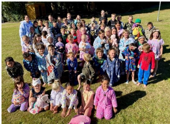
We had a wonderful response to our pj day on Friday