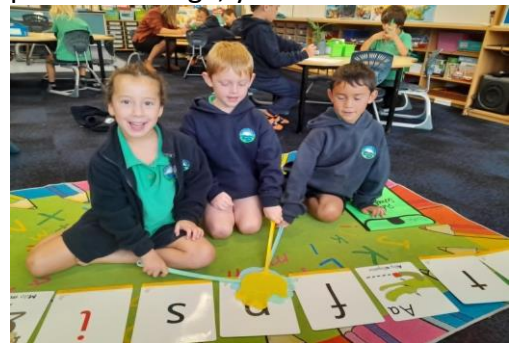
5-year-olds hard at work!

Whānau, as the weather gets cooler and wetter, it is important that all Kōwhai students please keep a dry change of clothing (including undies and socks) in their school bags please. Please also ensure they have shoes and a jersey/coat each day too so we can safely continue our outdoor learning on cooler days. We had a roaring start to the term with bringing book bags in each day, but this has slowed down, please encourage your tamariki to pop their book bags into school bags each morning as we use the contents in our classroom learning every day. Every student has heart words, a book and some basic facts problems to practice at home. Thanks for your support with this, and thanks for sharing your precious taonga, your tamariki with us!