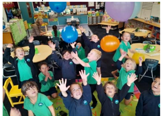
Our WOW word balloon party.