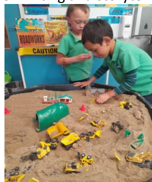
Kotuku and Hunter develop their logging business at the tuff tray

Recently the school purchased a Tuff Tray which is a large, octagonal plastic tray, designed for messy and sensory play. Setting up weekly play provocations like our sandy construction site and this week's rainbow rice word search are great opportunities for learning through play. We have witnessed oral language and vocabulary development, rich social interactions, sensory needs being met, free flowing creativity and motivation for writing and storytelling.