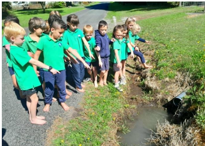
Finding 'Wonderful Wai' in our village.

We have a number of tamariki in Kōwhai with a passion for hunting, fishing and the outdoors. We are going to explore this topic further as a whole class. If you have any hunting or fishing magazines, old children's fishing nets or other items we may be able to use during this topic, please do share them with us. We'd be very grateful.