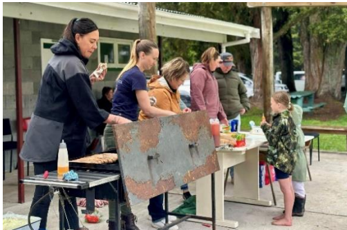
The PTA making and serving food