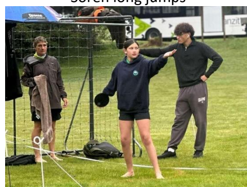
Hopaea throws the discus