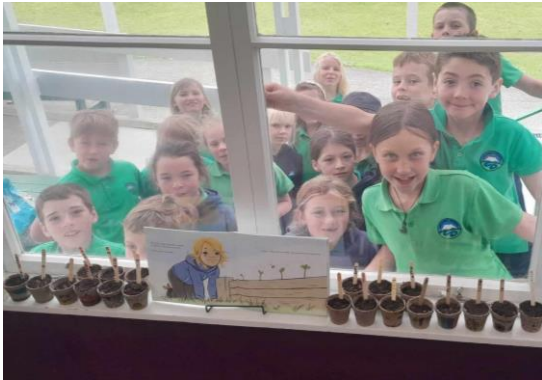
Keeping an eye on our sunflower seeds.