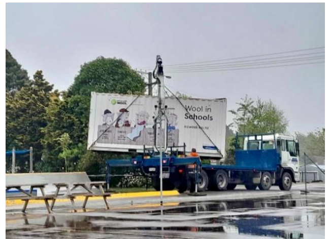
The Wool in Schools education container arrived on Friday, it is here for two weeks

Please fill in the permission slip below so that your child can attend this compulsory trip, part of their learning. Sorry, due to limitations in the space available, this trip is not open to parents to attend.