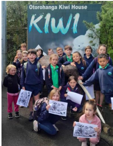
Class photo at the Kiwi House

Alive came in and judged our projects and we celebrated with a mini prizegiving, bird bingo and bird quiz with them.