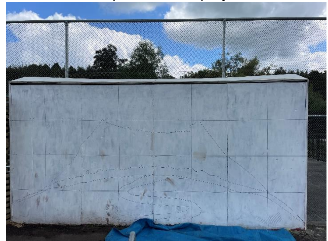
The ball wall is readied for the first coat