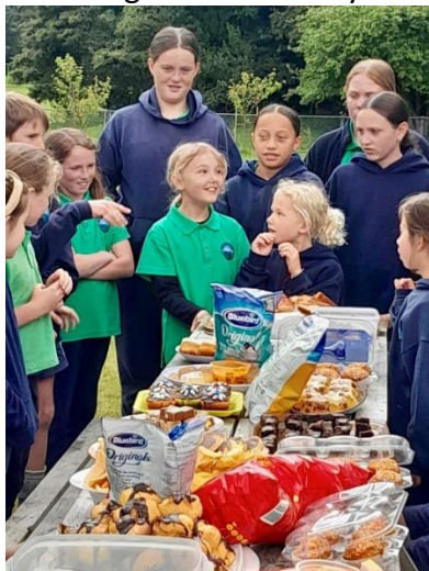
The children anticipate the shared morning tea