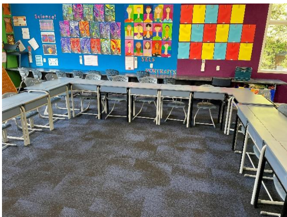
Kahikatea room looking smart with its new carpet