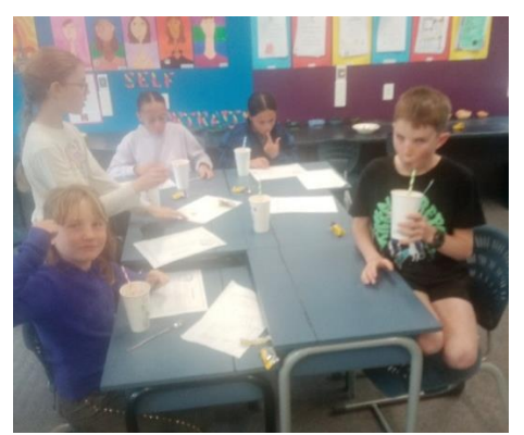
Planning, designing and evaluating the hot chocolates

Congratulations to all competitors - I look forward to seeing them race at the Interschool Cross Country in week seven.