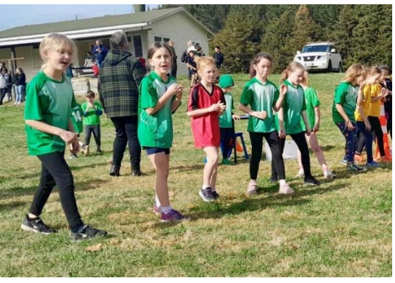
The year 4 girls line up