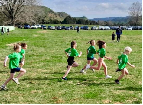
The year 2 girls