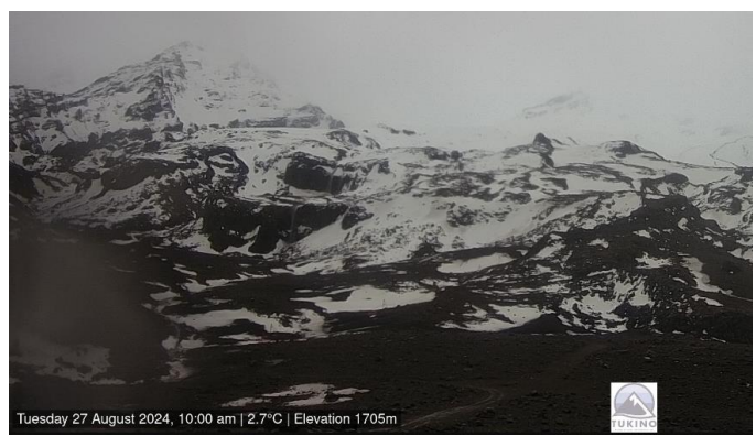
An image from the Tukino webcam on Tuesday showing how little snow there is at Tukino after the warm rain.

As you were informed on Wednesday night, we have had to cancel our ski camp due to insufficient snow to run the lift at Tukino. Parents who have paid their money for this camp will be receiving a full refund. We have many disappointed children, so the teachers have planned a series of fun events for this week.