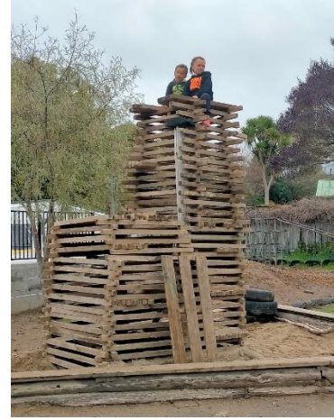
Hut building in the sandpit

Tilia Brewer = 2024 Best Back, Taumarunui U11.