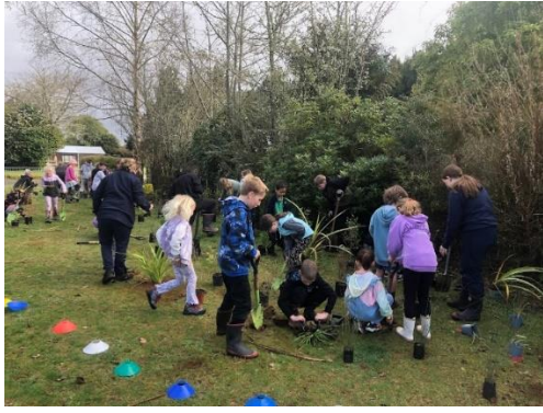
It was as busy as a beehive with everyone planting