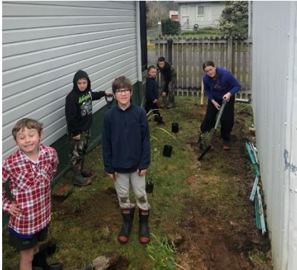
We even planted between the changing sheds and the firewood shed