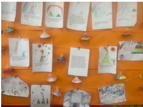
The Battle of the Mountains writing