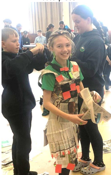
Gin modelling the winning uniform