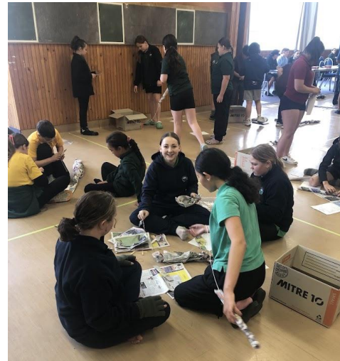
Ōwhango Team #One designing a fishing rod that needed to get a tennis ball out of the box that was 1.5m away.

Challenge in Taumarunui. There were eight local primary schools participating with two teams from each school. Ōwhango's Team #2 put an amazing entry in the very first activity which was the only 'known challenge' which meant the students knew what they had to do in this challenge, prior to Friday, so they were able to practise at school and discuss it beforehand. This challenge required them to make a formal uniform representing New Zealand. They came FIRST which was a very impressive feat! The three other activities on the day also required teamwork, and knowledge of engineering, maths and art. All of our students represented Ōwhango School with amazing behaviour and awesome teamwork. It was a very fun and competitive day, the tamariki look forward to this each year.