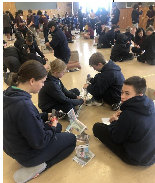
Ōwhango Team #Two hard at work, collaborating and designing.