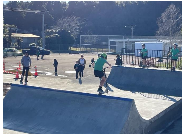
The kids have their turn...