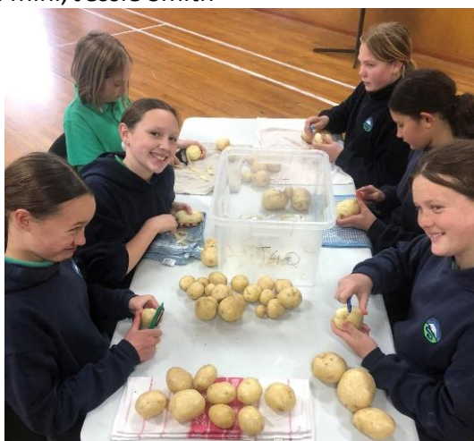
The senior class peeling potatoes...