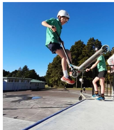
Zurich gets some air