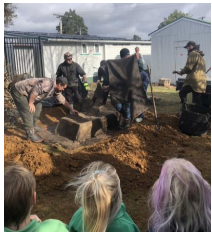
Dad's, Uncles and Koro's taking out the steaming hāngī