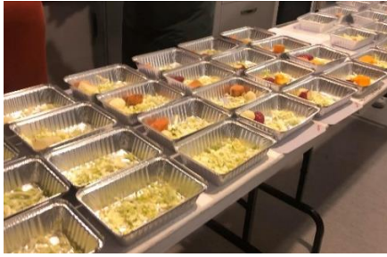
The staff's 7:00am prep of 150 hāngī trays