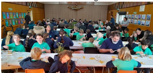
Then we ate our kai