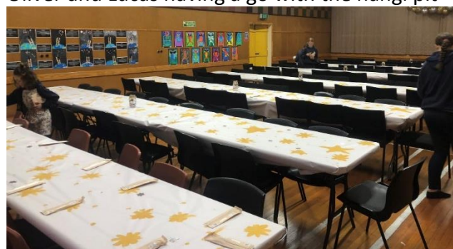
Hall decorations are completed with hand painted tablecloths