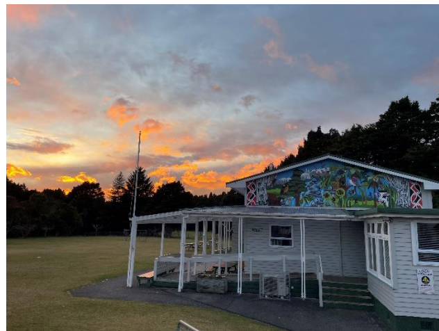
The beautiful sunrise on the day of our Matariki hāngī

As you will see from the Dates to Note above, we have another busy term next term. So, I hope you all have a restful time with your family over the two week holidays, and come back refreshed for the second half of the year.