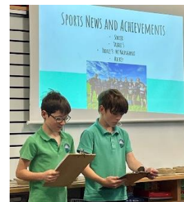
Zurich and Beau go through the recent sports news and achievements