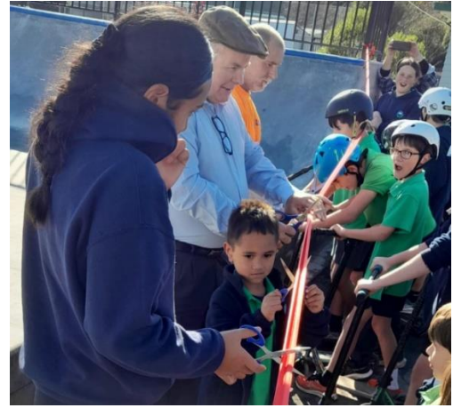
The ribbon cutting, note the kids desperate to get past the ribbon and onto the park!

It was also great to see the park getting a lot of use over the long weekend. This is a welcome addition to our playground and our community. Once the weather warms up we will be sowing grass on the surrounding topsoil, we ask that you keep of this until the grass has been established.