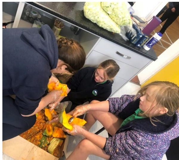
...and preparing pumpkins for the hāngī