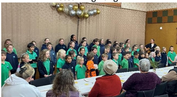
The tamariki entertained our guests with waiata