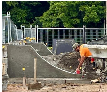
The curved shapes are starting to be concreted into place