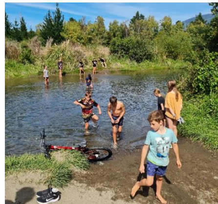
Some went for a swim afterwards