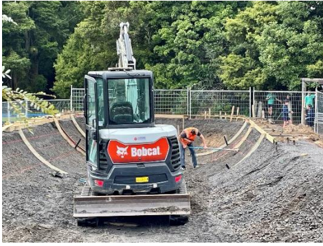
Wooden guides help shape the half pipe formation