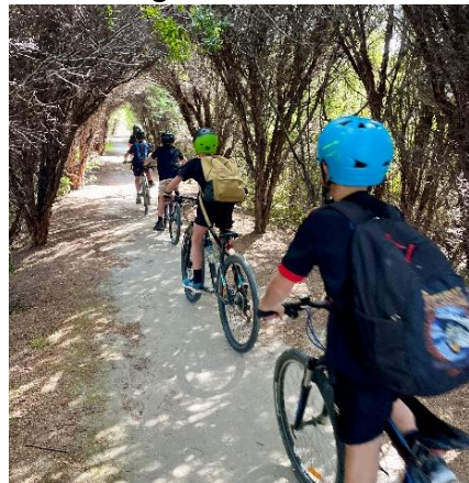
The tree tunnel