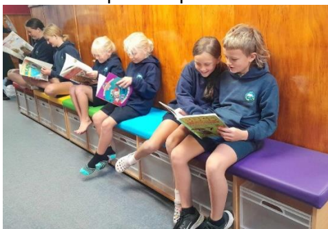
The seats are getting a lot of use