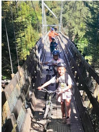
Crossing the swing bridge