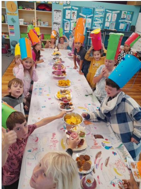
Mad Hatter's tea party.