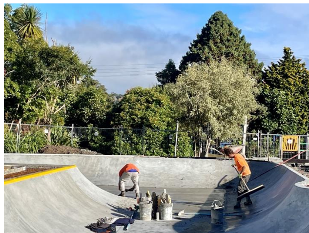
Today they did the final pour for the inside of the bowl