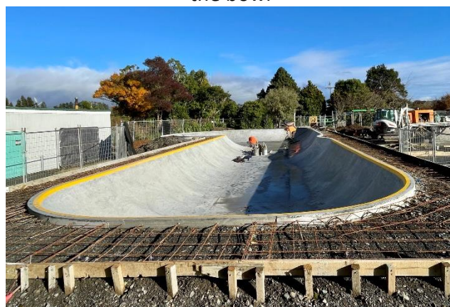
The bowl just needs the surrounding walkway to be poured to be completed