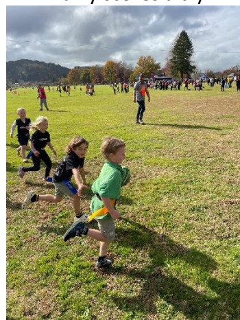
Jack runs from a rip