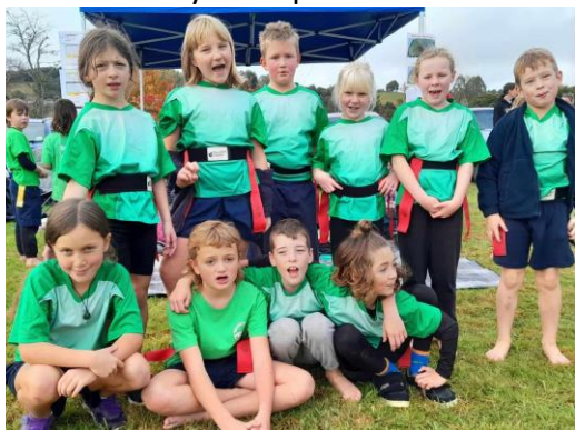
Ōwhango All Blacks

getting us to the right games on time. There was a great display of skill, sportsmanship, leadership and positive attitudes from all of our players on the day. Tino pai tamariki mā.