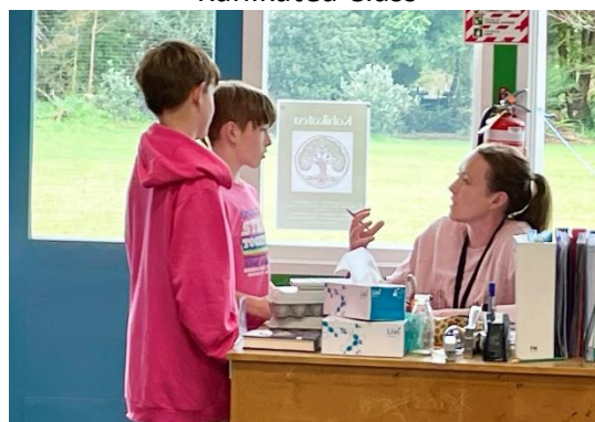
And all of the teachers participated