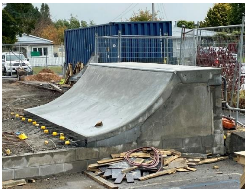
The quarter pipe is well on its way to completion