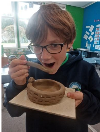
Zurich with his bowl and spoon

They then used various instruments to create patterns and texture on the side of their bowls. The clay will sit out to dry for a week before the next step...firing and then glazing. Watch this space!